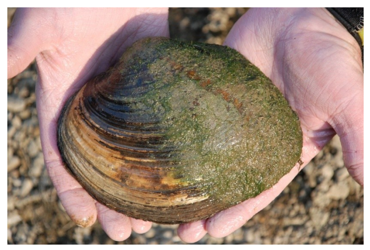
One of many awesome mussel species found in midwestern U.S. rivers: Lampsilis cardium, "big as a saucer!"