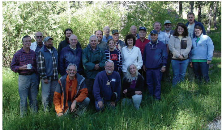
Attendees of the ninth North American Plecoptera Symposium