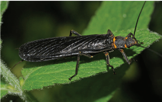
Pteronarcys princeps - a local hero- was there too.