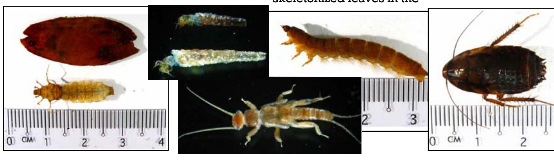
Selection of Malaysian shredders (L to R): caddisflies—Calamoceratidae and Lepidostomatidae, stonefly—Nemouridae, beetle larva—Eulichadidae, and an amphibious cockroach—Blattodea.